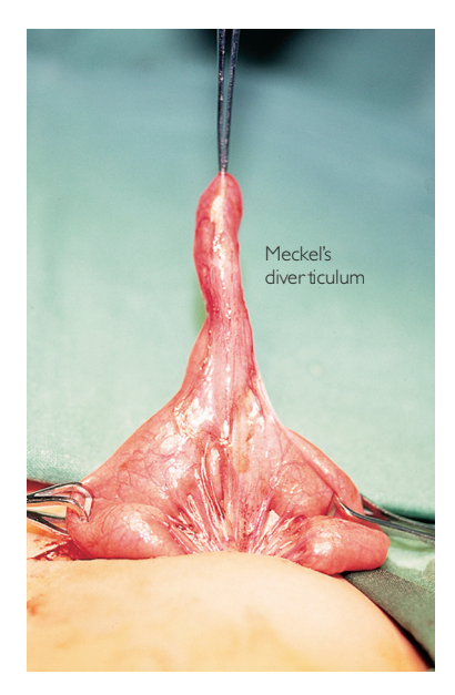
Figure 62.2 Meckel's diverticulum.